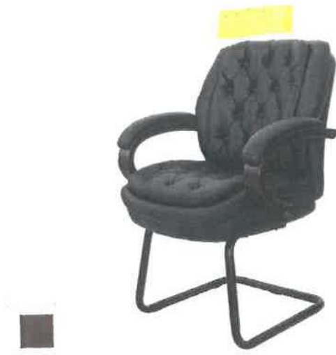
President Visitor Chair