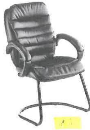
Pinnacle Visitor Armchair