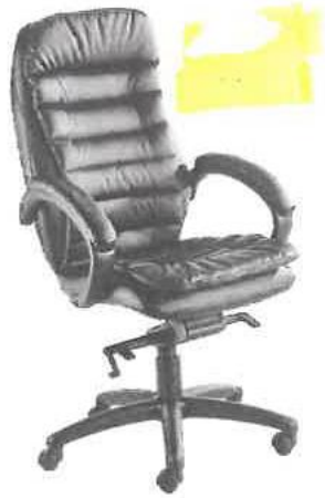
Pinnacle High Back Chair