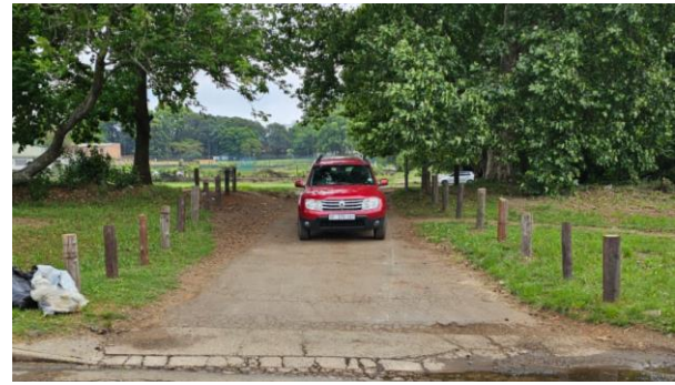
One set of double gates