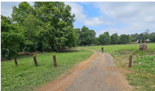
One set of double gates